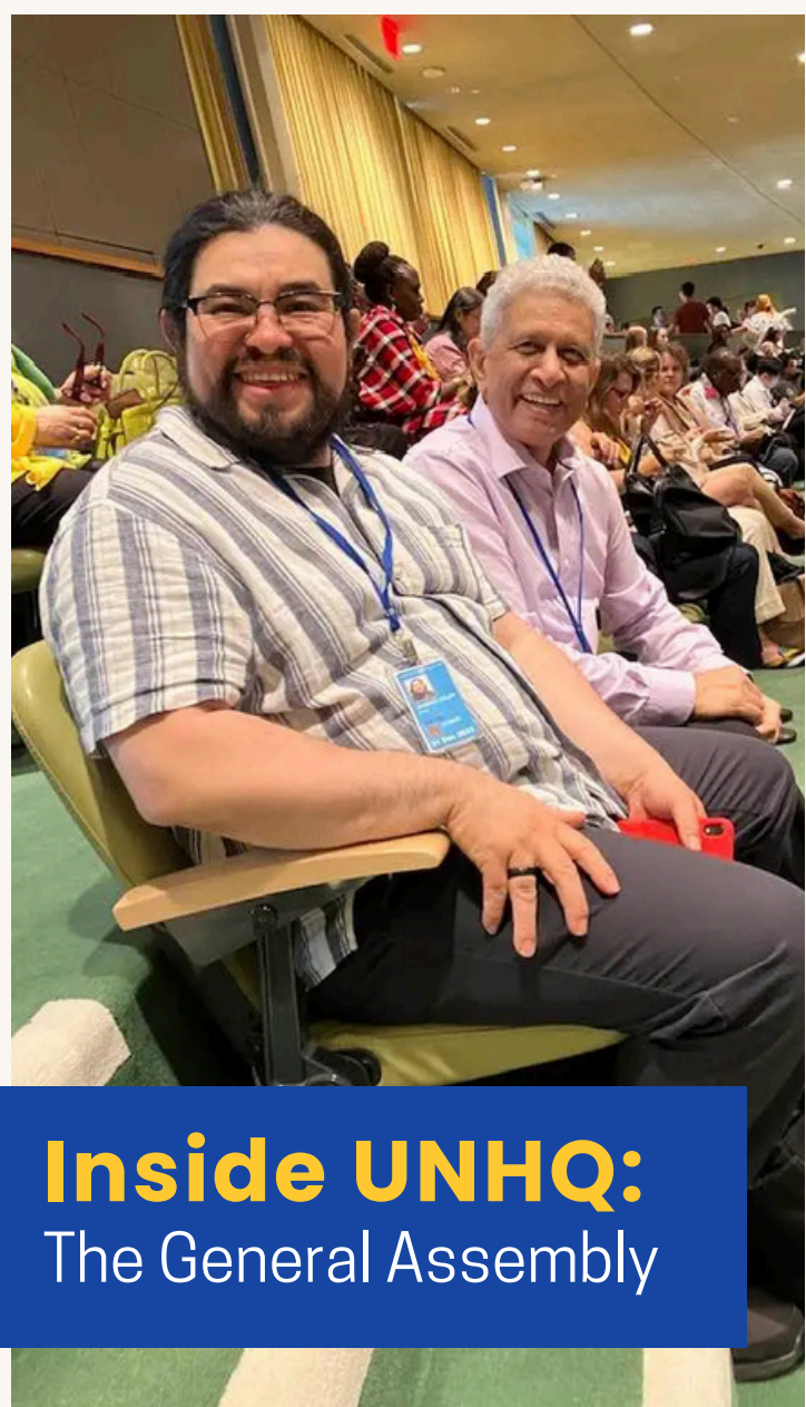
Inside UNHQ: The General Assembly

From 29 August 2025, no new passes will be approved or issued for representatives of NGOs in consultative status with the Economic and Social Council for the duration of the high-level week of the General Assembly. Access to the United Nations premises will be granted with valid United Nations grounds passes only until 21 September 2025. From 22-29 September 2025, the use of annual and temporary grounds passes for NGOs in consultative status with the Economic and Social Council to enter the UN Headquarters complex will be suspended. The usual procedures for UN Grounds Passes will be reinstated as of 30 September 2025.