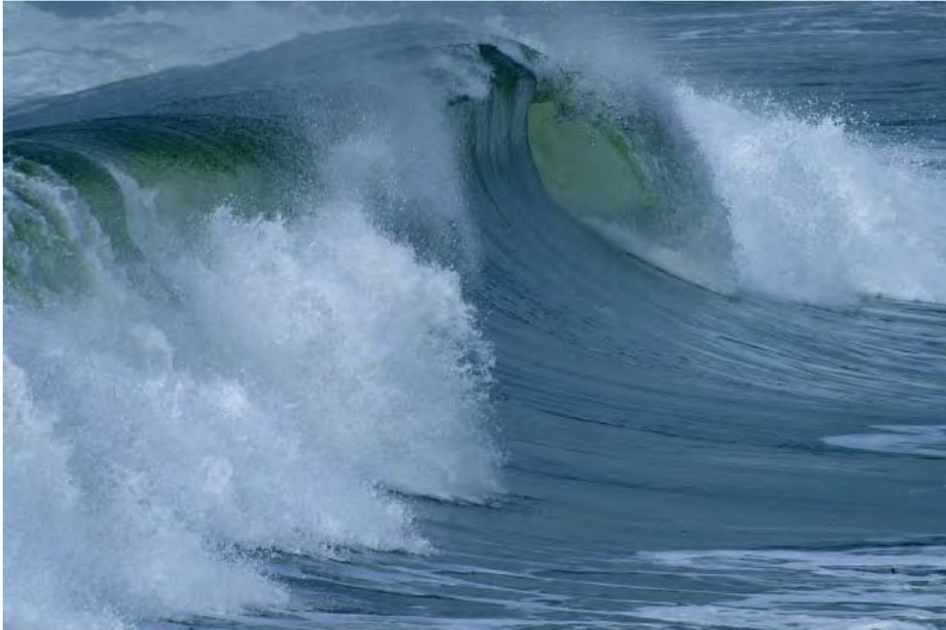
Public domain image

I hope for your help to explore and protect the wild ocean in ways that will restore the health and, in so doing, secure hope for humankind. Health to the ocean means health for us.