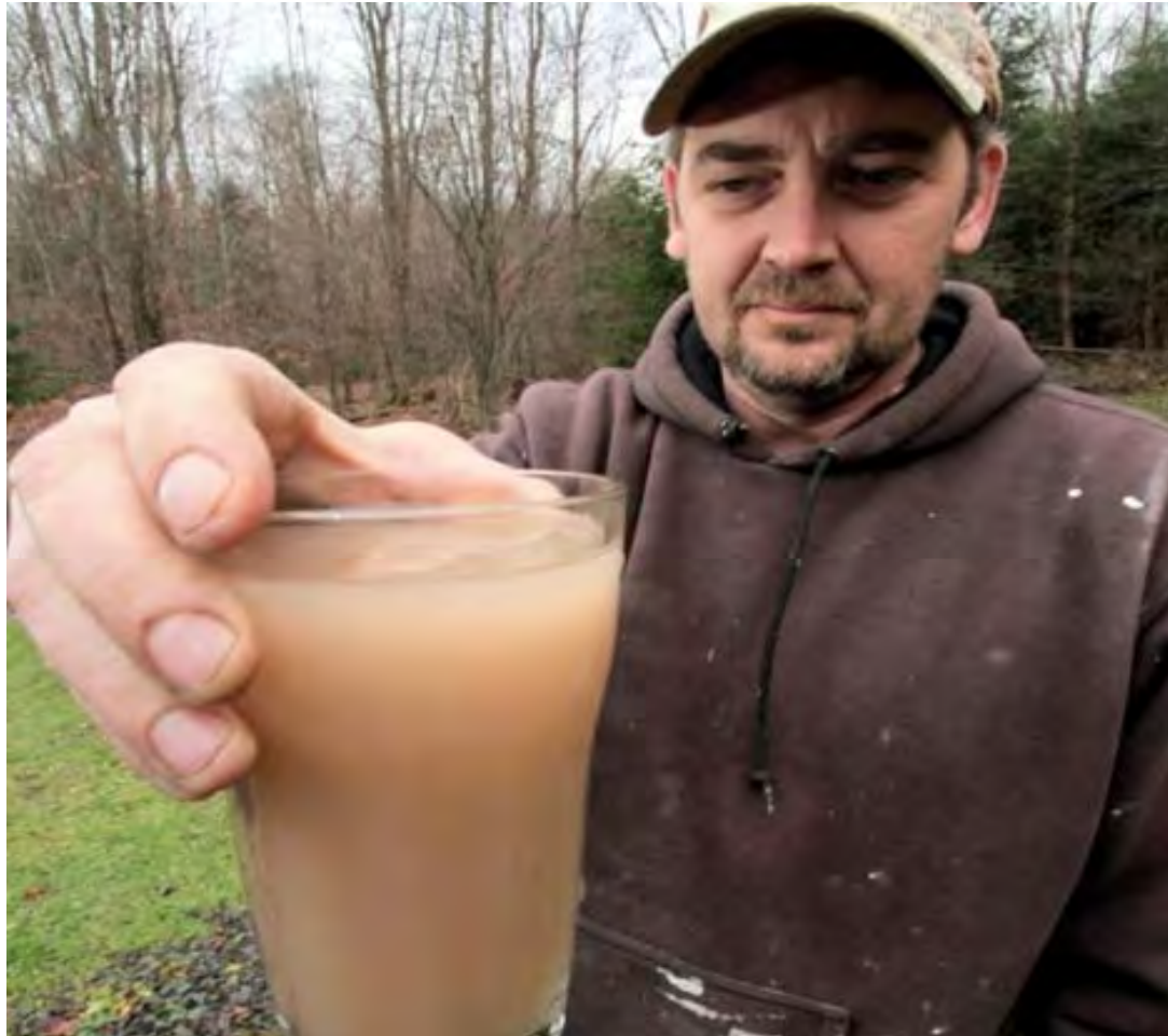
Public Domain Image

“Til taught by pain, men really know not what good water is worth.”