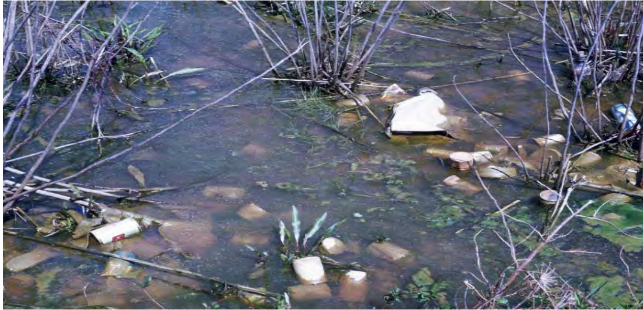
US Fish and Wildlife Service

Concern for the fate of the great rivers of the Earth must lead us to reflect soberly on the model of development which our society is pursuing. A purely economic and technological understanding of progress, will inevitably provoke negative consequences for individuals, peoples and creation itself.