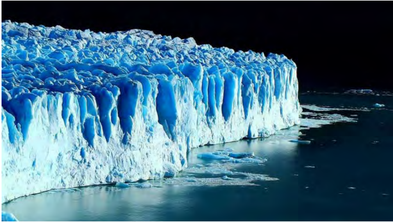
US Geographic Survey

There is no water in oxygen, no water in hydrogen: it comes bubbling fresh from the imagination of the living God, rushing from under the great white throne of the glacier. The very thought of it makes one gasp with an elemental joy no metaphysician can analyze. The water itself, that dances, and sings, and slakes the wonderful thirst – symbol and picture of that draught for which the woman of Samaria made her prayer to Jesus – this lovely thing itself, whose very wetness is a delight to every inch of the human body in its embrace – this live thing which, if I might, I would have running through my room, yea, babbling along my table – this water is its own self its own truth, and is therein a truth of God.