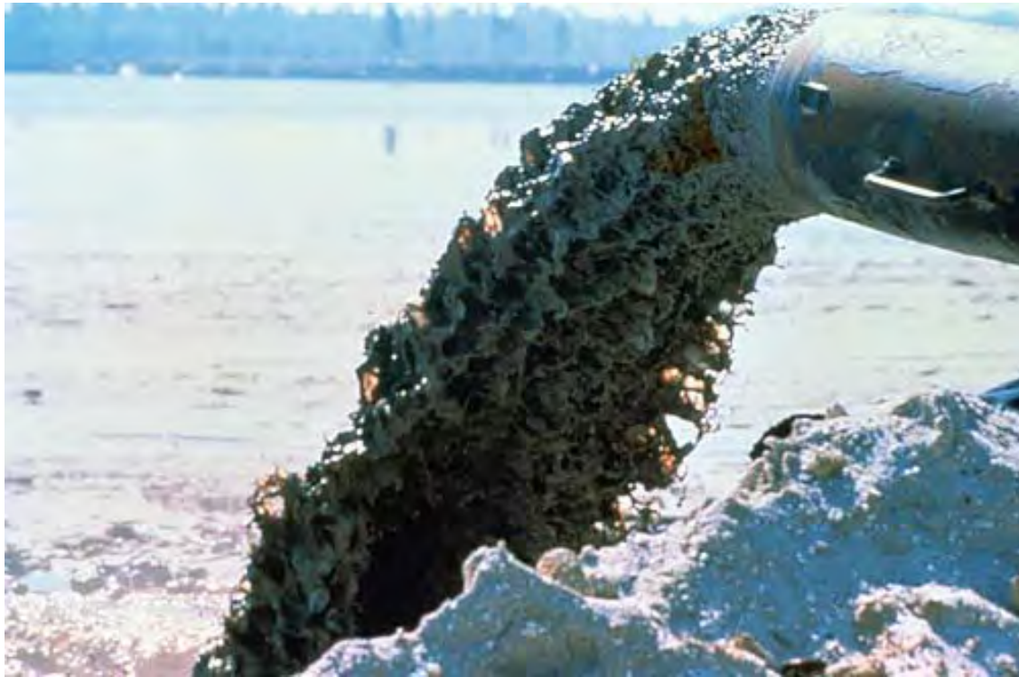
US Fish and Wildlife Service

“In an age when man has forgotten his origins and is blind even to his most essential needs for survival, water along with other resources has become the victim of his indifference.”