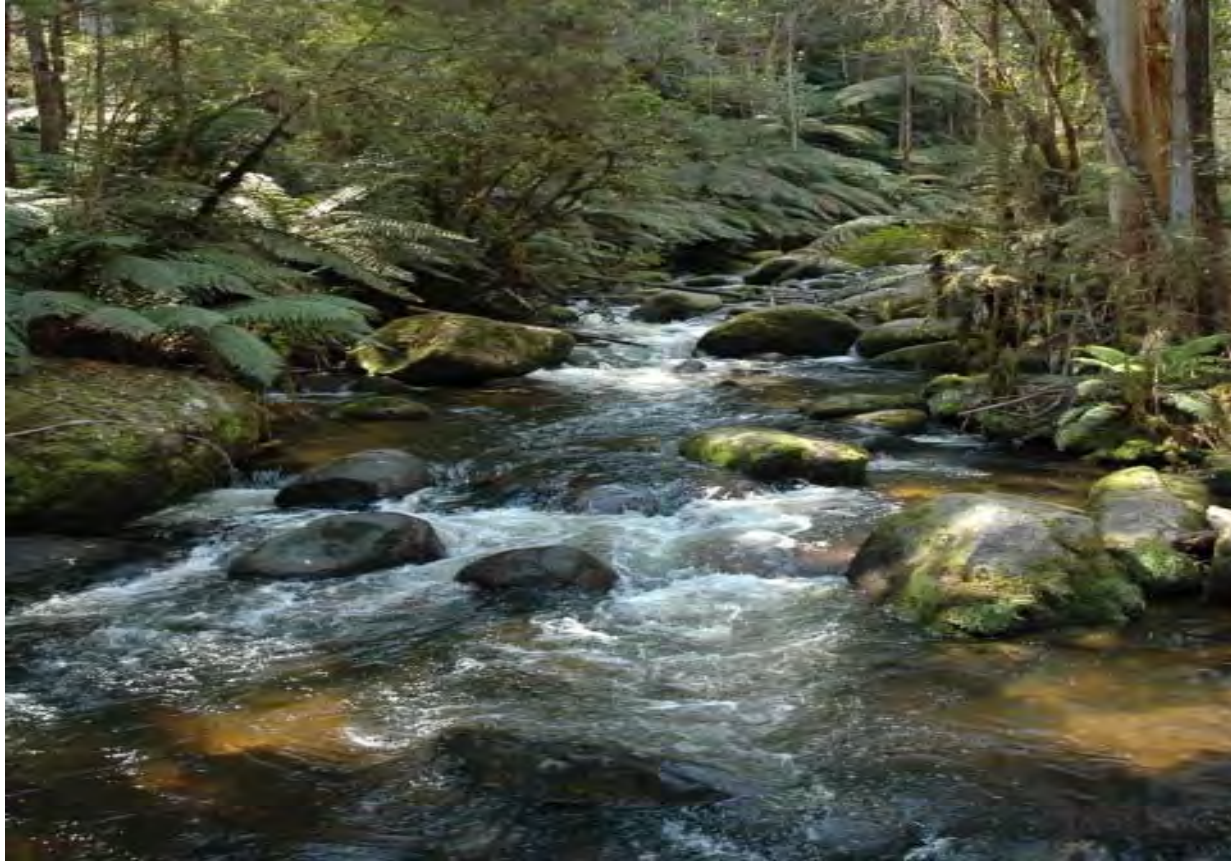
Public Domain Image Picture

Water is the driving force of all nature.