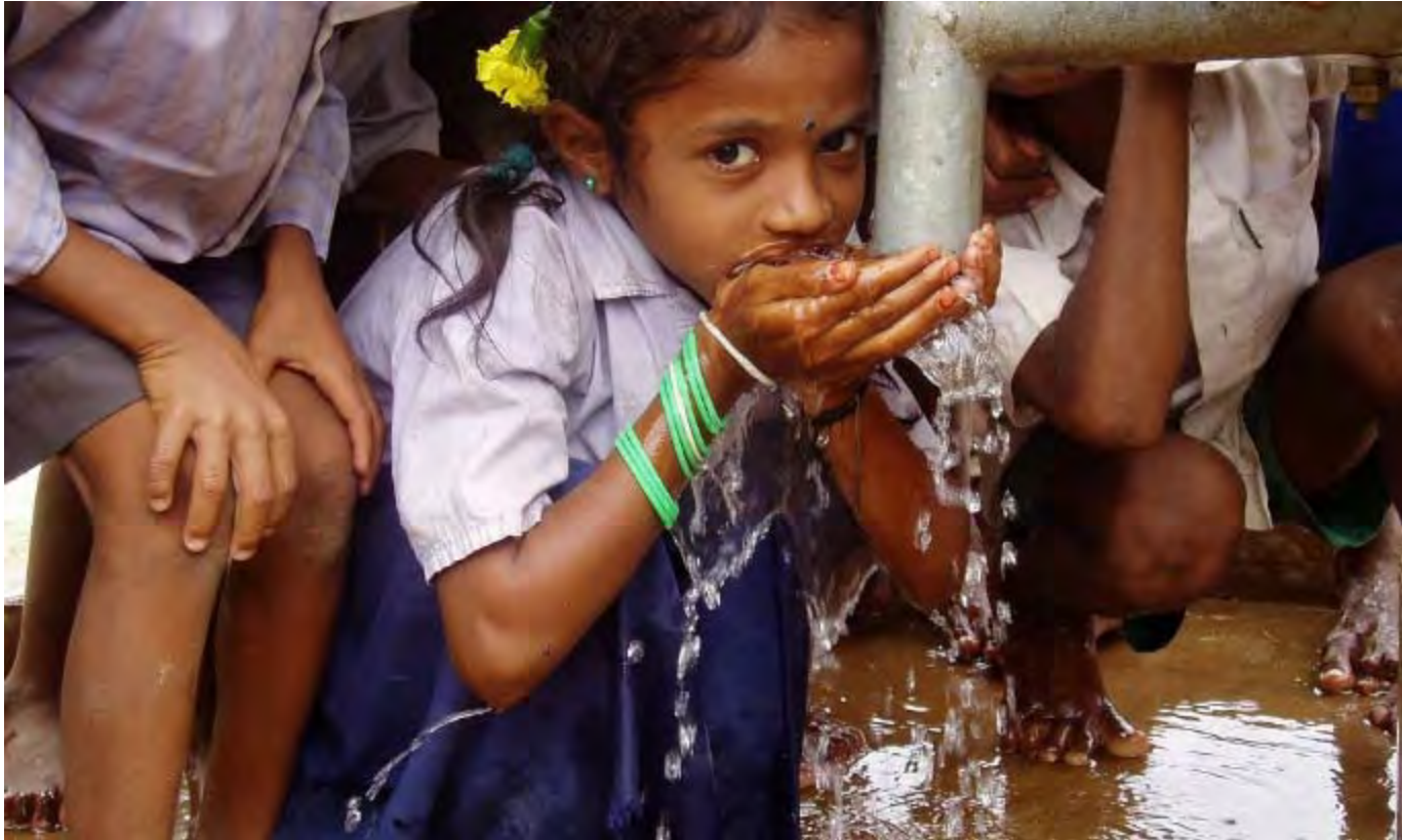
Public Domain Image

“If we lived in a desert and our lives depended on a water supply that came out of a steel tube, we would inevitably watch that tube and talk about it understandingly. No citizen would need to be lectured about his duty toward its care and spurred to help if it were in danger.”