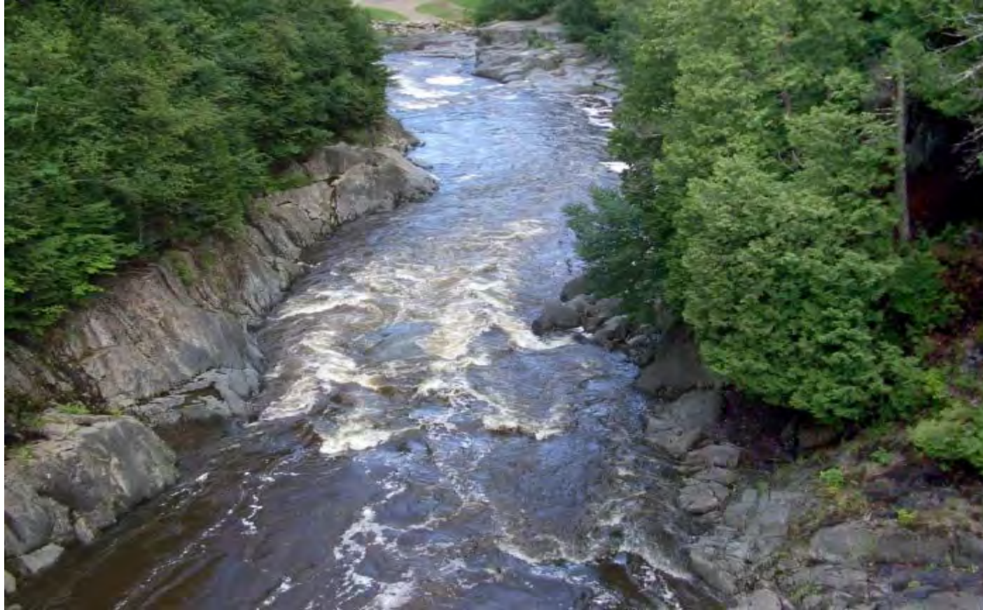
Marianne Gagnon Copyright Free Image

Rivers, ponds, lakes, and streams – they all have different names, but they all contain water. Just as religions do – they all contain truths.