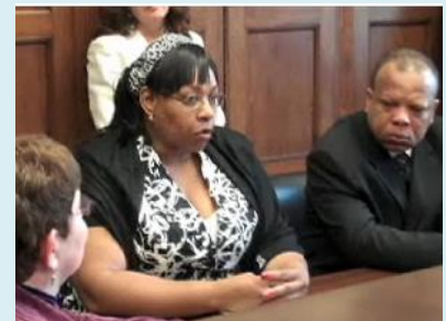
Above, members of St. Camillus visit their Senator to share their concern about war in the DRC. Below, they sell crafts.

Back at the parish, they stepped with the charitable works foot by holding a craft sale to benefit Catholic Relief Services programs that assist victims of war in the DRC.